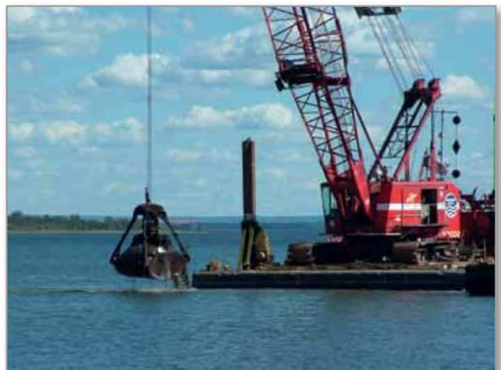
Dredging material off Erie Pier, Port of Duluth-Superior