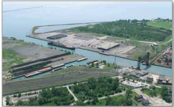
Calumet River and Harbor: the major deep-draft commercial harbor and site of the Chicago CDF

construction projects, including public recreational areas. It is now successfully marketed and sold by Grand Haven's Verplank Dock Company, a main harbor constituent, under the brand "Bottoms Up." Some material from this site that contained a high percentage of sand has been used for construction projects, most recently for the U.S. 31 bypass project.