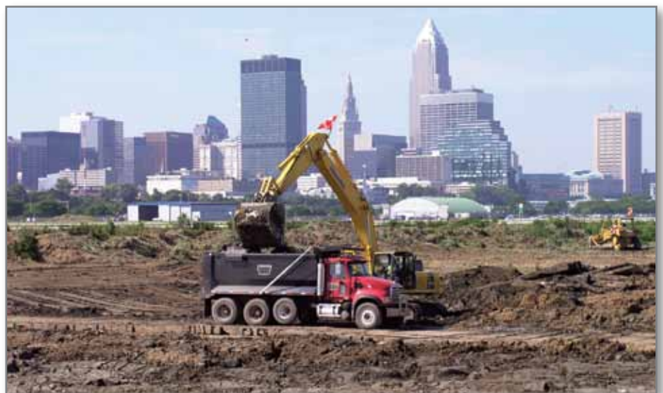
300,000 cubic yards of sediment was removed from CDF 10B in Cleveland and used to cap a 58-acre Brownfield site off Pershing Avenue. The site is slated for redevelopment as an industrial park.

With annual tonnage of over 10 million tons and an economic impact of more than $800 million in job support alone, maritime commerce on Cleveland's Cuyahoga River is a major contributor to the northeastern Ohio regional economy. The port is also one of the most heavily dredged facilities on the Great Lakes, requiring some 250,000 cubic yards of sediment to be removed each year for placement in