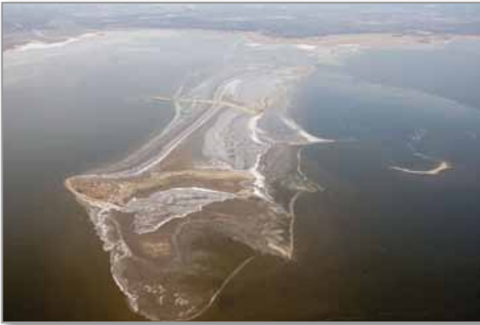
Aerial View of Cat Island Construction, Green Bay

2004. Wet sediment deposited in Chicago was consistent enough to be handled efficiently and remain where it was placed. The sediment dried well and formed soil structures similar to those observed in the demonstrations. Within a year, and with no seeding, the formerly barren brownfield on the shore of Lake Michigan was lush with vegetation.