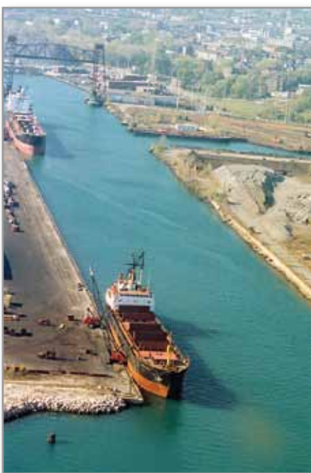
Calumet River, Chicago

Intergovernmental agreements among the Chicago Park District, the City of Chicago and the Illinois Department of Natural Resources were signed and the project, named "Mud to Parks," began in April