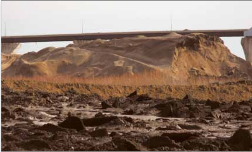
Coarse material stockpile at Erie Pier, Port of Duluth-Superior

The Port of Duluth-Superior is the largest and busiest on the Great Lakes by tonnage, handling an average of 40 million tons annually of commodities including iron ore, coal, limestone and grain, plus heavy-