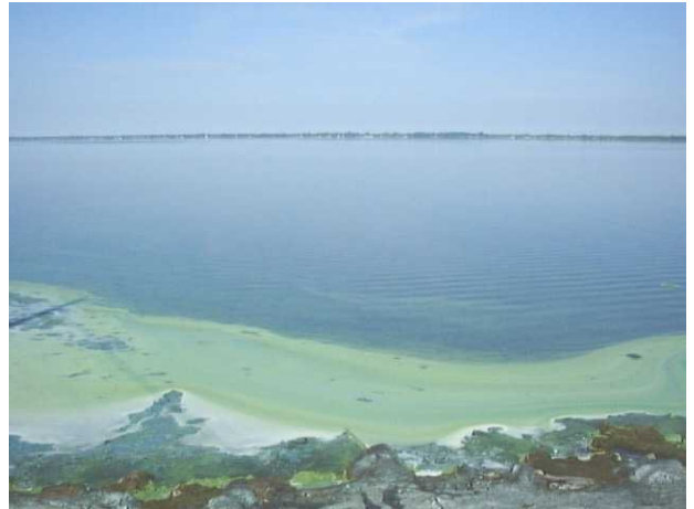
Blue-green algal bloom, Lake Champlain

There are many species of single-celled organisms living in the Great Lakes, including algae. When certain conditions are present, such as high nutrient or light levels, these organisms can reproduce rapidly. This dense population of algae is called a bloom. Some of these blooms are harmless, but when the blooming organisms contain toxins , other noxious chemicals, or pathogens, it is known as a harmful algal bloom, or HAB. HAB's can cause the death of nearby fish and foul up nearby coastlines, and produce harmful conditions to marine life as well as humans.